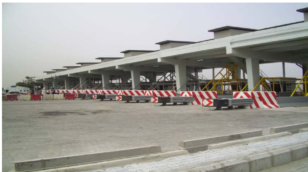
Figure 1 Admiralty Circle Toll Plaza at CH 3+000 of the Lekki –Epe Toll Road.

Under an Abridged Works Contract dated February 2007, the first twenty Kilometres of road construction has been successfully completed but only twelve Kilometres has been handed back to the Concessionaire (LCC Monthly Report, 2011b).