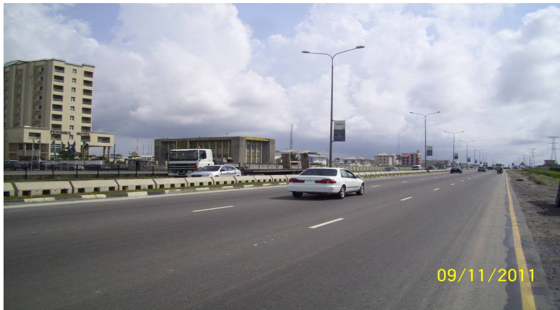
Figure 2 Rehabilitated & Upgraded Section of the Lekki-Epe Toll Road.

may be repositioned to mitigate problems with moving some of the overhead lines. LASG is responsible for providing to LCC land which is free of occupation and services.