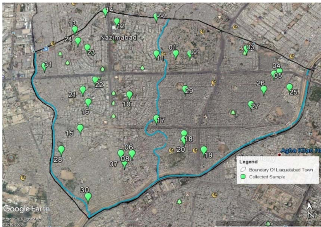
Fig. 2 Sample Location map using Google Earth Image

Thirty-one groundwater samples were randomly collected from depth range of 16-78 meter. Groundwater was electrically pumped for 2-3 minutes to get representative sample from the aquifer. Location of each well was marked with the help of Global Positioning System (GPS) on the Google earth image (Fig. 2).